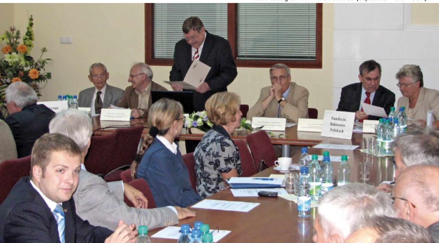
The Meeting of PRF – IKS Founders (September 23rd 2009)