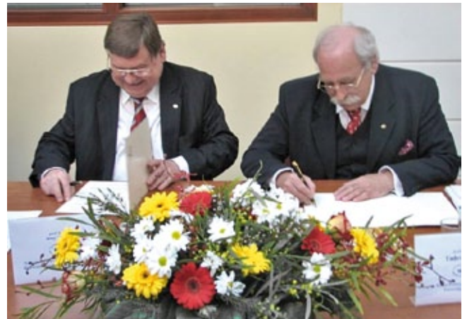
Signing the strategic agreement between CRASP and PRF (March 25th, 2006)

concerning the contents of a directive issued by the minister in charge of higher education"; the report on the project was published jointly by PRF and CRASP in a book of the same title.