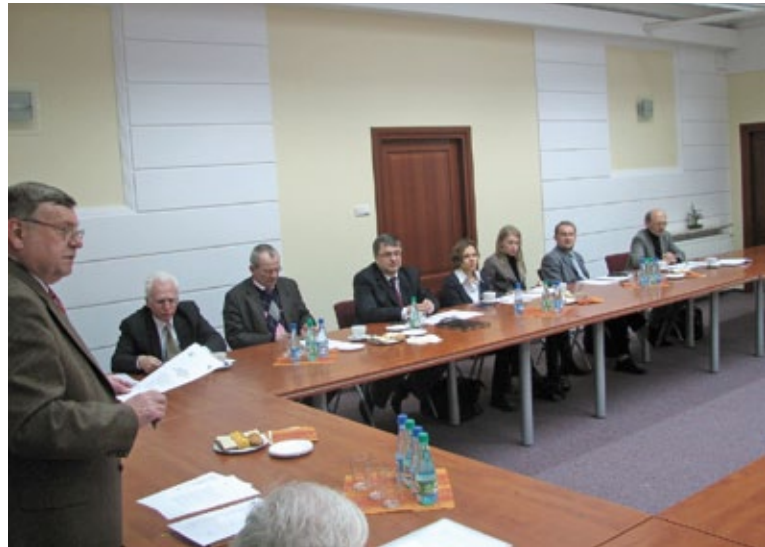
A Meeting of the Steering Committee (February 18th 2008)

It was agreed that the distribution of the results will take place electronically; periodically the results will be traditionally published in printed form. The data collected are accompanied by methodological comment, they provide information regarding individual parameters and