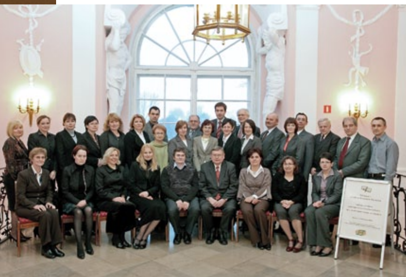
IV Summer School of PRF for rectors – elects of the term 2008 – 2012 (July 12th – 20th 2008)