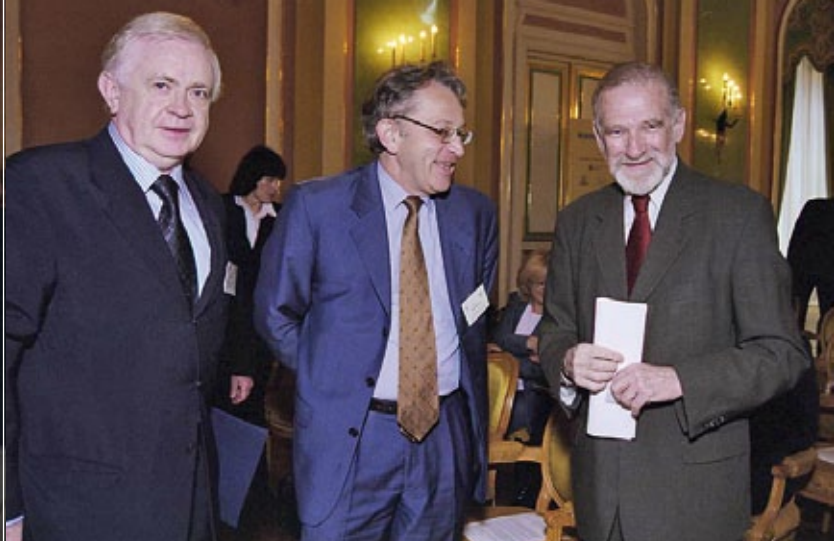
Conference "New generation of Policy Documents and Laws on Higher Education: Their Thrust in the Context of the Pillars of the Bologna Process (November 2004)

the recommendations concerning harmonizing legislation on higher education in Europe.