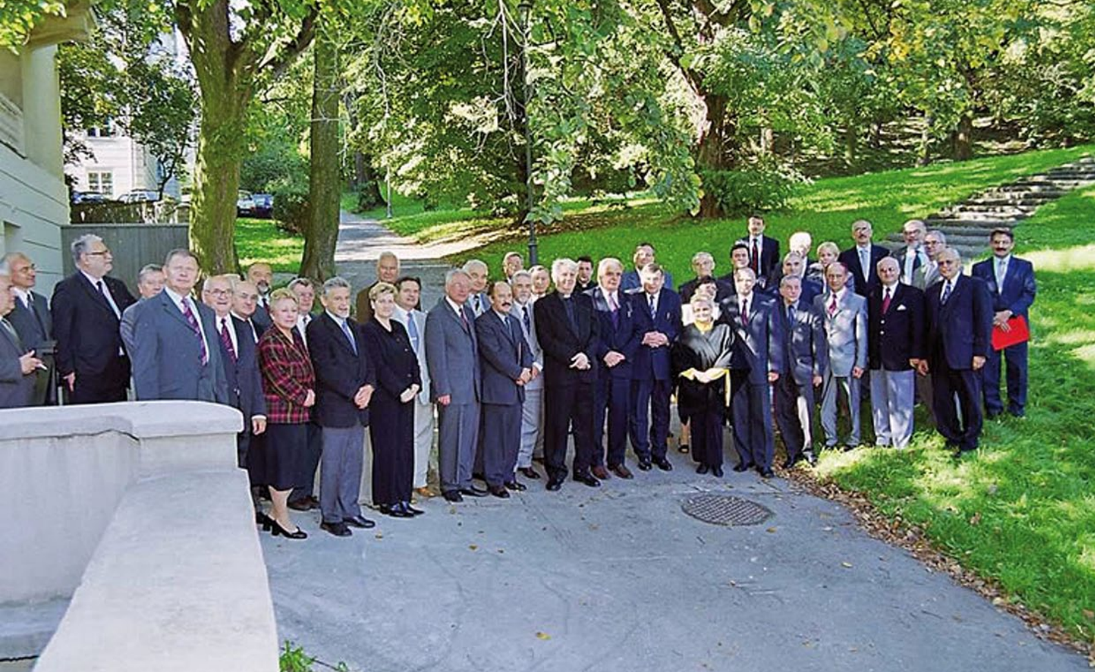
The Meeting of rectors – founders of PRF and IKS (September 26th, 2003)