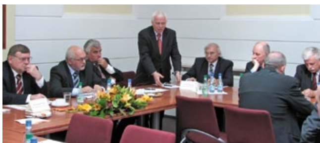
The Meeting of PRF – IKS Founders (September 10th 2007)

the presentation and discussion over the legislative delegations into HEIs statutes, as well as statutory options under the new Act on Higher Education (2005);