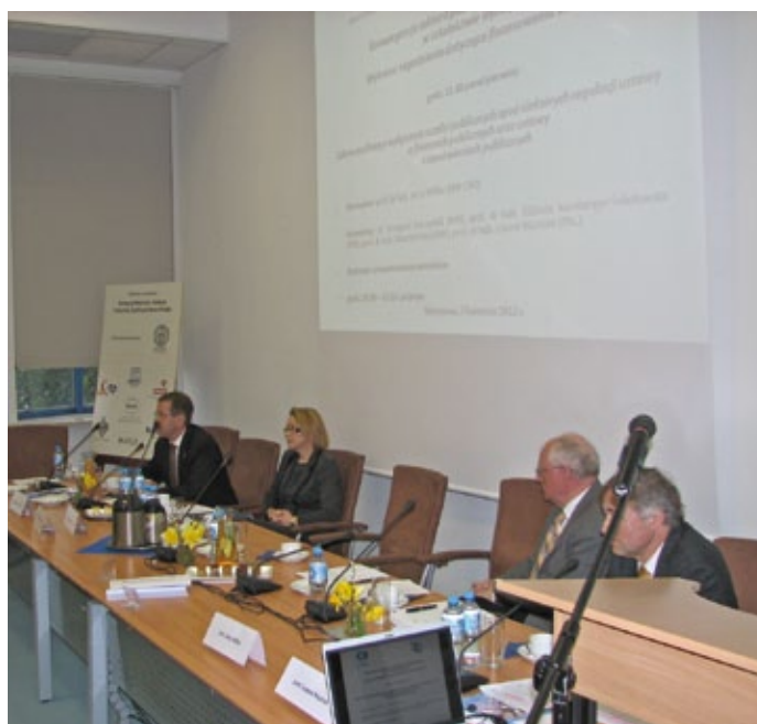
The conference “The Convergence between Public and Non-Public Sectors of Higher Education” (April 7th 2011)