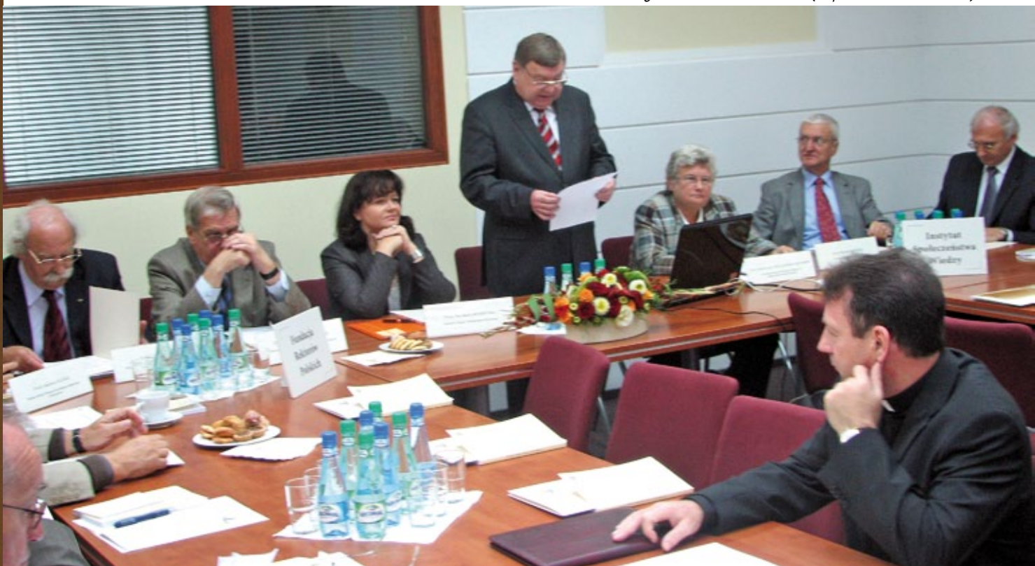
The Meeting of PRF – IKS Founders (September 17th 2008)