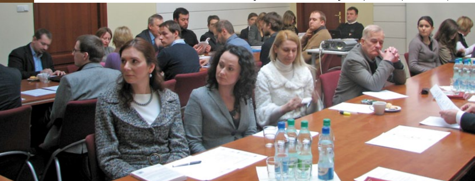
The Seminar “The Role of Higher Education in the Knowledge Society Formation” (June 1st 2009)

In all the Seminars there has been the total number of participants amounting to approximately 100 – they were PhD students specializing in the issues of higher education.