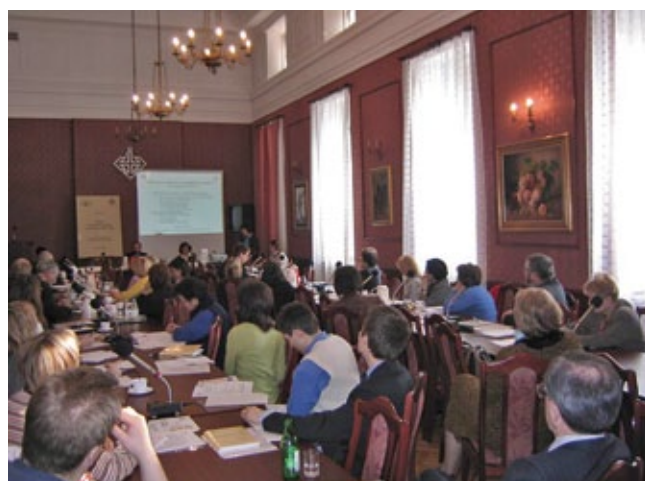
Seminar "The offer of higher education versus labour market requirements" (June 12th 2005)

The Foundation also expressed its view on, at that time widely discussed and extremely significant, the issue of Lisbon Strategy. PRF, in cooperation with the Institute of Knowledge Society, organised a series of seminars on the role of HEIs in the process of the strategy implementation, with the support of the National Bank of Poland and the Office of Committee for European Integration. The recorded speeches and debates taking place during the seminars were published in two volumes "The tasks of Polish HEIs in the implementation of Lisbon Strategy" (2004) and "The tasks of Polish HEIs in the implementation of new Lisbon Strategy" (2005).