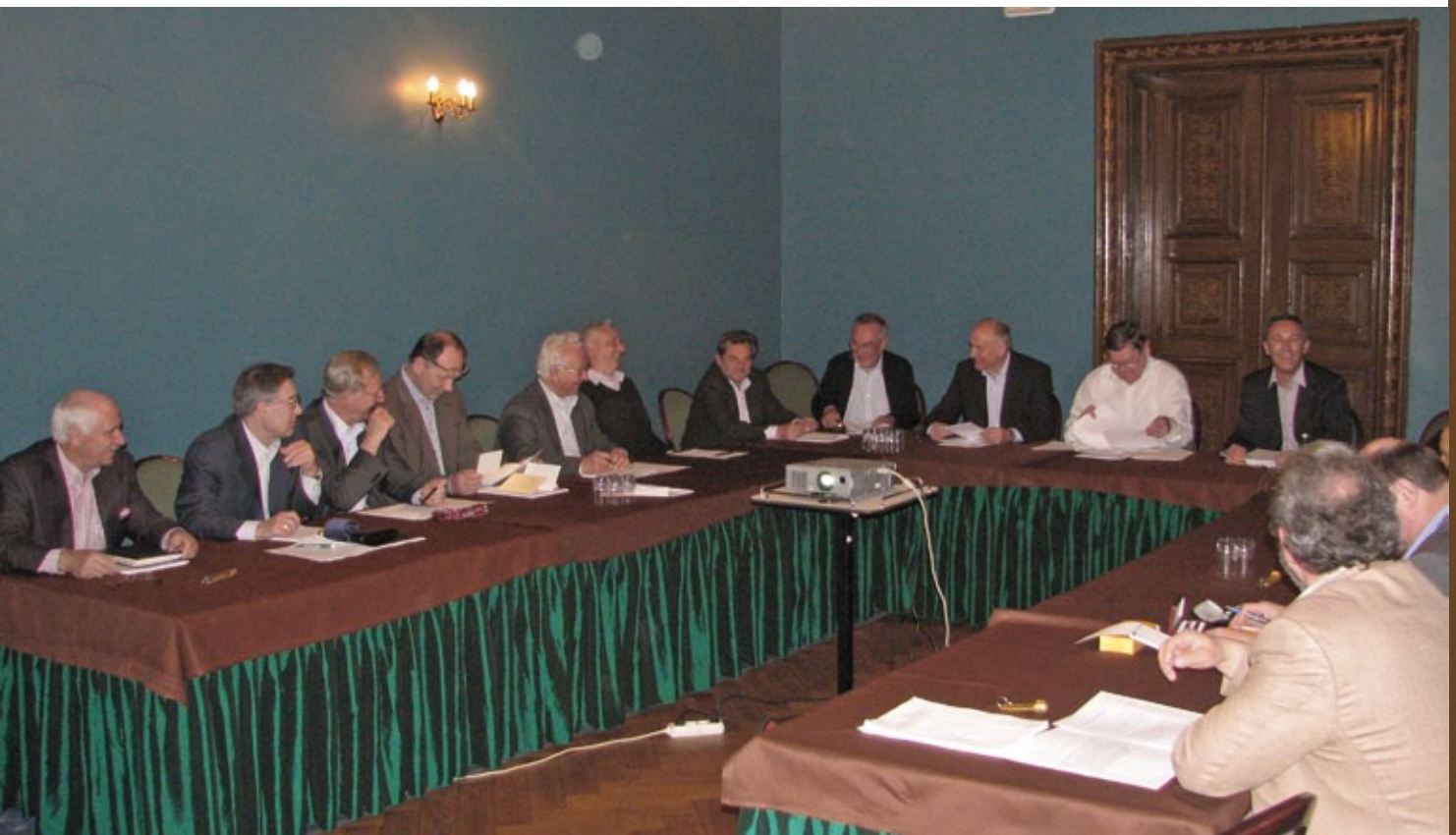
KOIL Meeting held away from the premises (May 8th 2009)