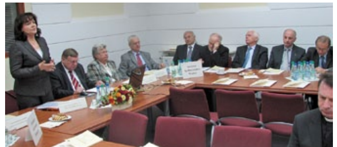
The Meeting of PRF – IKS Founders (September 17th 2008)