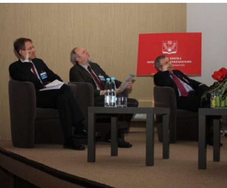
The Conference “Financing and Public – Private Partnership in the Higher Education System – Polish Practice versus International Experience” (April 2012)

services by Polish academic schools in the light of the EU acquis).