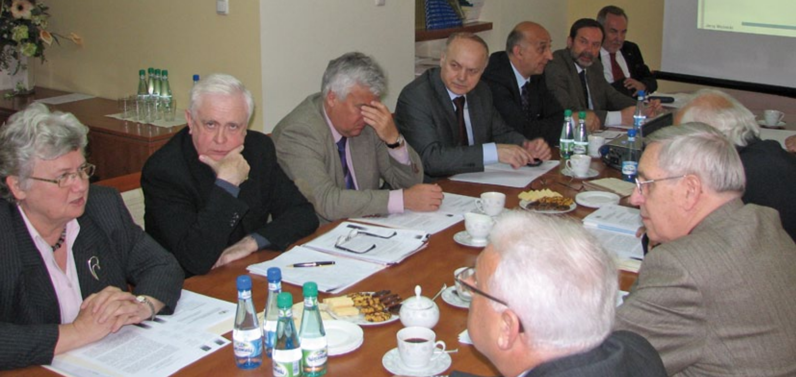
The Meeting of the Steering Committee of the project "Strategy for Higher Education Development in Poland: 2010 – 2020" (April 20th 2009)

Following the presentation of the academic community draft of "Strategy for Higher Education Development: 2010 – 2020" on December 2nd 2009 during an extraordinary Plenary Meeting of CRASP with guest participants, including Minister Barbara Kudrycka, Minister Michał Boni, as well as senators and MPs, the Presidium of CRASP, jointly with other Consortium members, decided to announce and commence public debate by means of meetings held in academic centres.