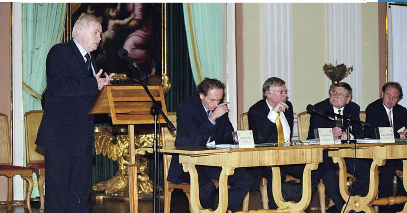
Conference "New generation of Policy Documents and Laws on Higher Education: Their Thrust in the Context of the Pillars of the Bologna Process (November 2004)

PRF was also a co-organizer of an international conference "Demography and Higher Education in Europe. An Institutional Perspective (October 12 – 13 2007) in Bucharest, Romania. It was organized by UNESCO-CEPES in cooperation with Elias Foundation of the Romanian Academy, OECD and the Institute of Knowledge Society. Additionally, the Foundation prepared a report "A study on present and future impact of demography on Higher Education in Poland".