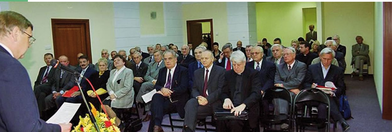
The Meeting of rectors – founders of PRF and IKS (September 26th, 2003)