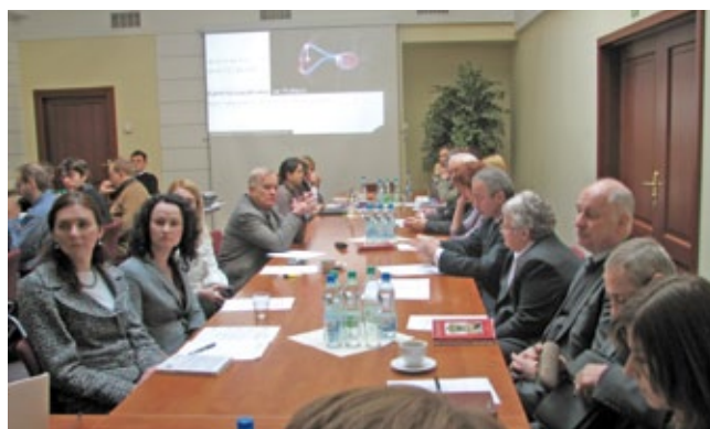
The Seminar “The Role of Higher Education in the Knowledge Society Formation” (June 1st 2009)