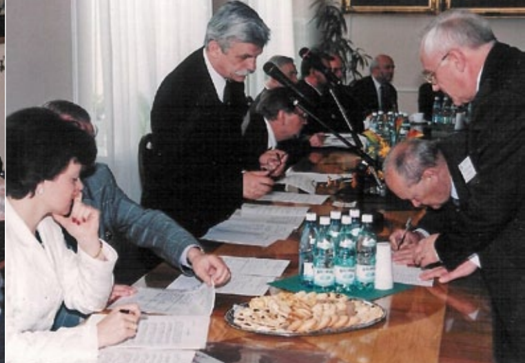
Signing the notarial deed of establishing PRF (June 7th, 2001)