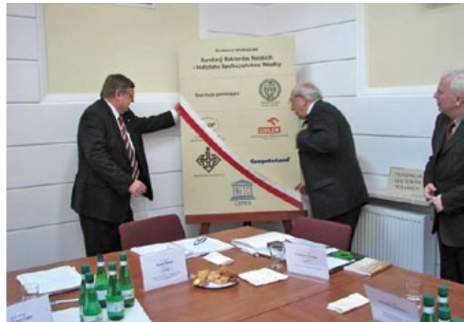
Signing the strategic agreement between CRASP and PRF (March 25th, 2006)

the Bologna Process Expert Team. The three forums were attended in total by approximately 200 participants (January 23rd, February 16th, March 17th 2012).