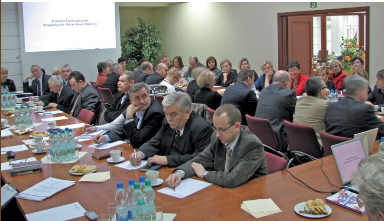
Discussion Forum of National Qualifications Framework (January 23rd 2012)