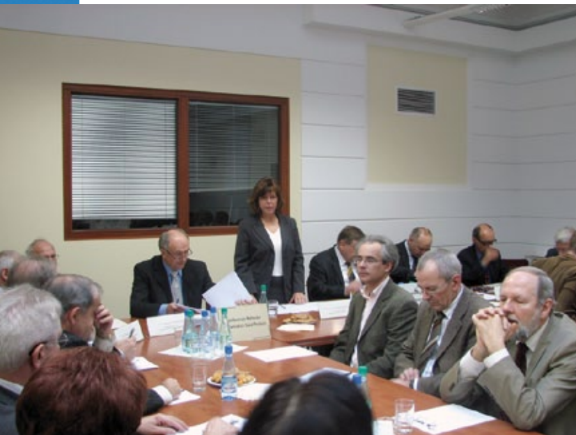
Works on the strategy (January 5th 2009)